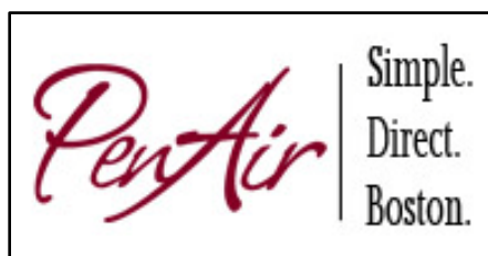
Sample banner on flyplattsburgh.com

flyplattsburgh.com is the number one lead generator for Allegiant Air, outperforming all other airport websites it serves.